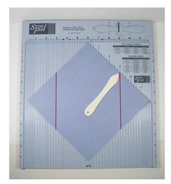
Step 2: Score at 3" and then again at 9".